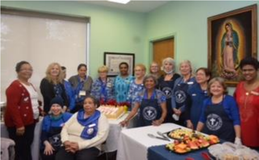
St. Anthony's Parish Brampton, Peel Region Celebrating 45 years.