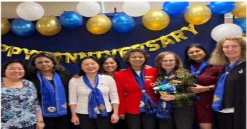
Precious Blood Parish, Scarborough Region Celebrating 40 years