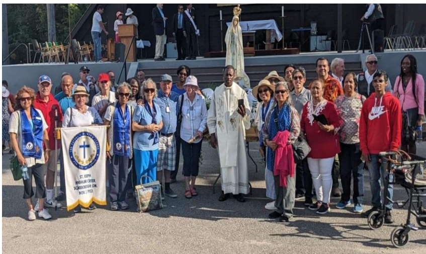
Members from St. Joseph (Highland Creek) CWL in attendance at Rosary Sunday.